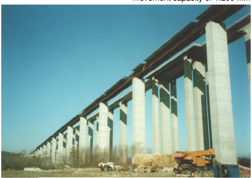
Fig.1: view of the Viaduct "Stura di Demonte"